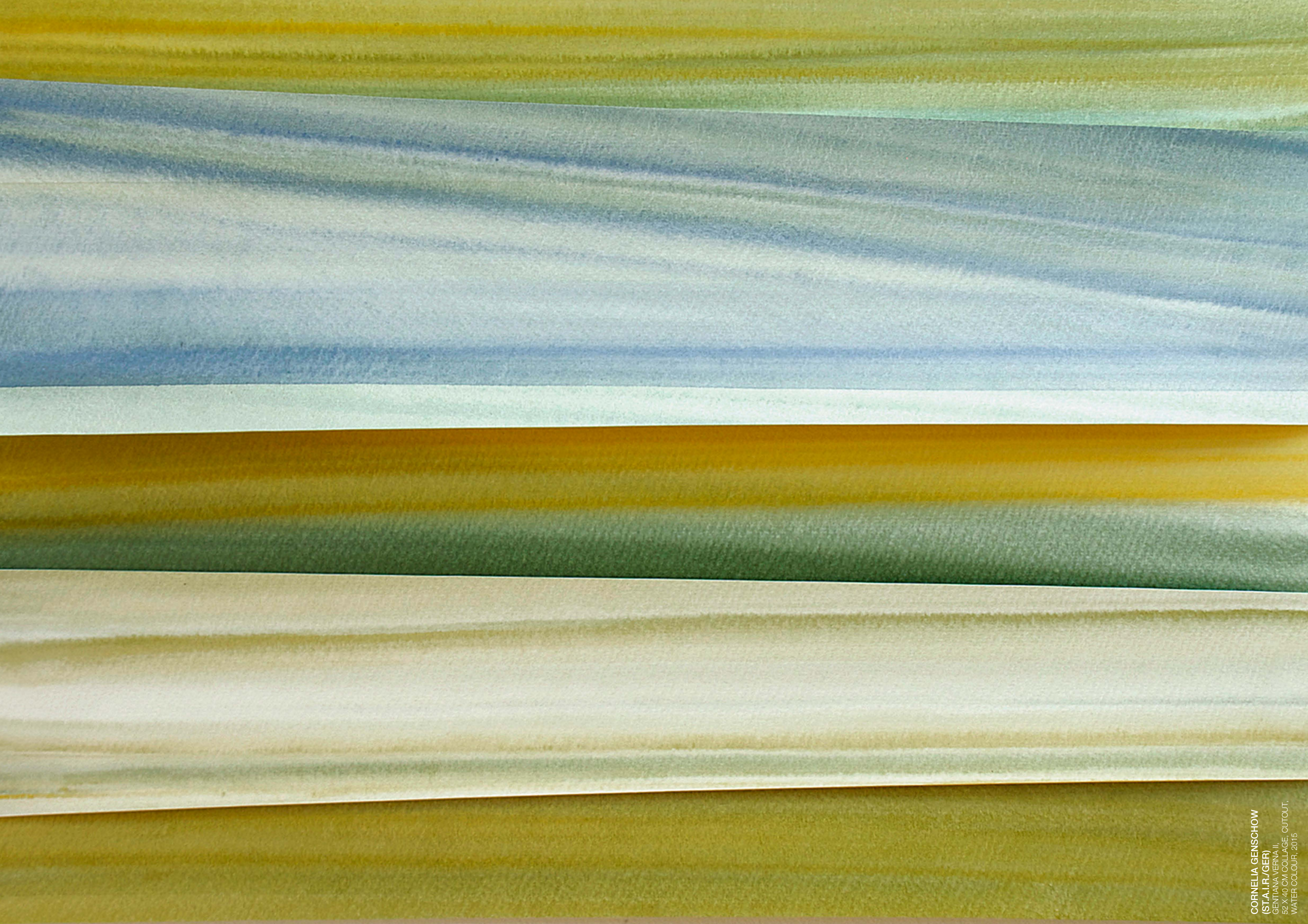
CORNELIA GENSCHOW (ST.A.I.R./GER) GENTIANA VERNA II, 52 X 40 CM COLLAGE, CUTOUT, WATER COLOUR, 2015