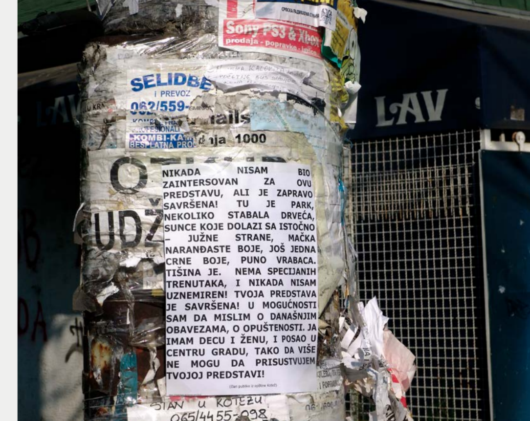
CHRISTINA LEDERHAAS (STUDIO SCHOLARSHIP ABROAD IN BELGRADE, 2015) PERPETUUM MOBILE / AUDIENCE AT THE WINDOW